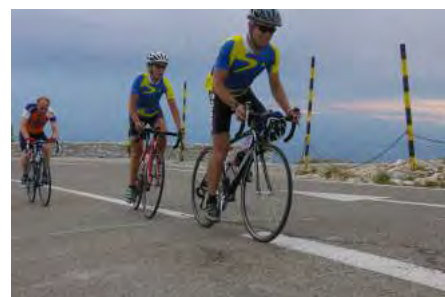
500m to go and the strain is obvious

My bucket list contained some iconic events/rides with qualifying for the Age-Group Triathlon World Championships being the final and most difficult challenge. Highlights have been cycling up Mont Ventoux 3 times in a day;