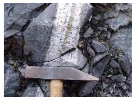
A calc-silicate bed in Moine schists, Arisaig