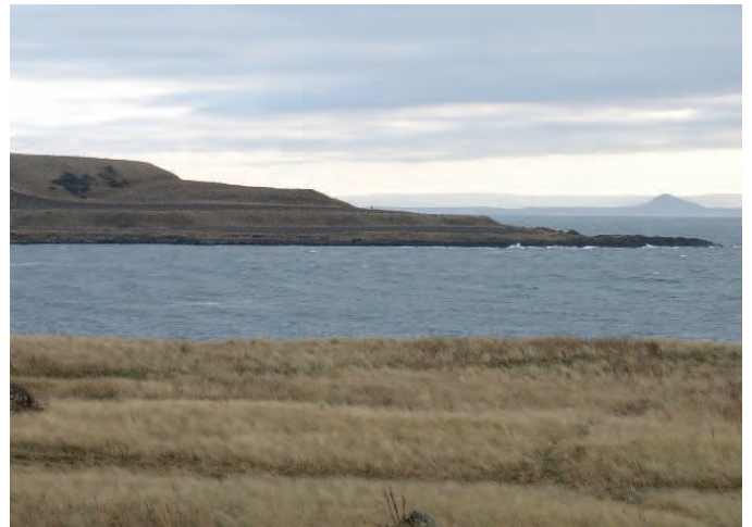
Raised beaches, Kinraig, Elie

We are always interested to receive news from our alumni which we are pleased to publish in the Newsletter and the SEES website.