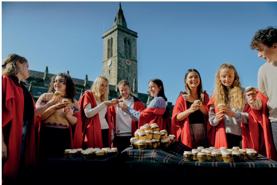
The icing on the cake: a historic double first for the University of St Andrews

We were delighted to hear at the beginning of September that we had been ranked top University in the Guardian University Guide 2024 for the second time in two years. But the icing on the cake came just over a week later when we learned that we had also been ranked the leading university in the UK in The Times and Sunday Times Good University Guide 2024 .